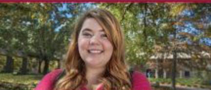
LAUNCH YOUR CAREER